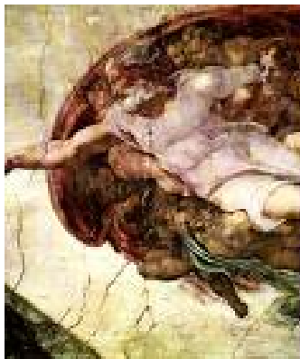
God as He creates Adam.