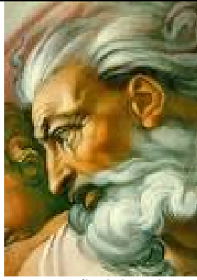
Where can you find the glory of God